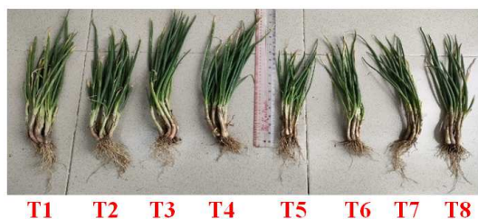
Figure 1. Green onion of 8 experimental treatments under the field conditions in Tran De district, Soc Trang province, Vietnam in crop 1 (04/2022-06/2022).

The results of the fresh yield of green onions over two experimental crops under field conditions are presented in Table 12, Figure 1 and Figure 2.